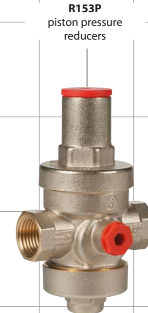
R153P piston pressure reducers