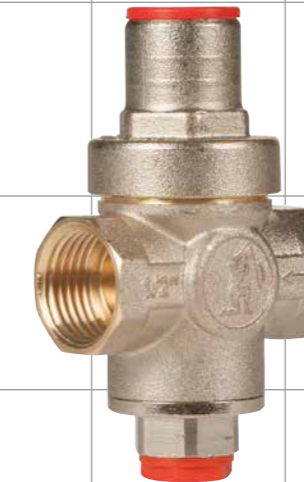
R153C compact piston pressure reducers