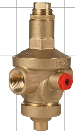
R153M membrane pressure reducers